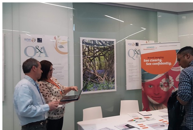
Siemens Exhibit at Imaging in England 2018