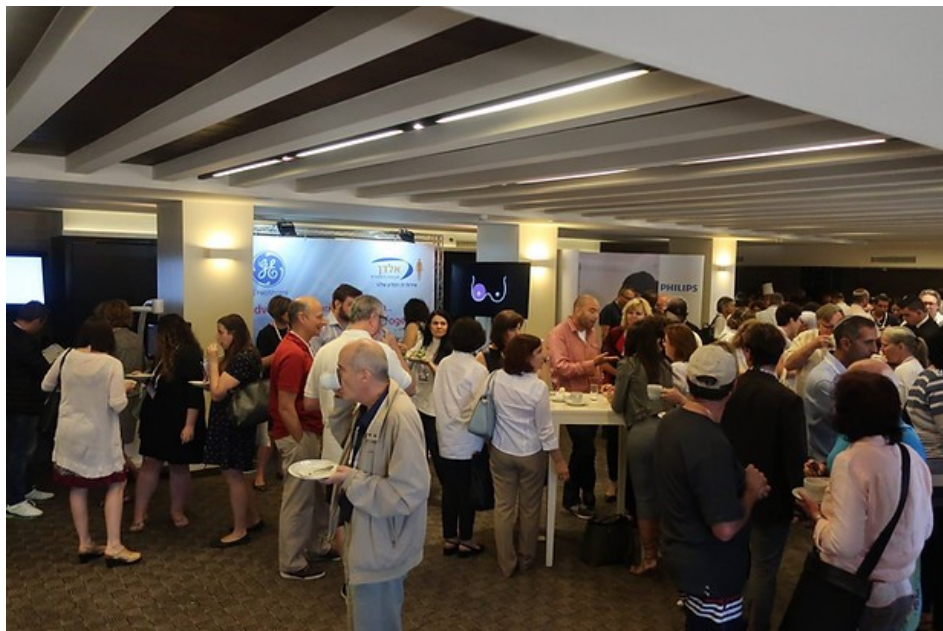
Exhibition Space at Imaging in Israel 2017