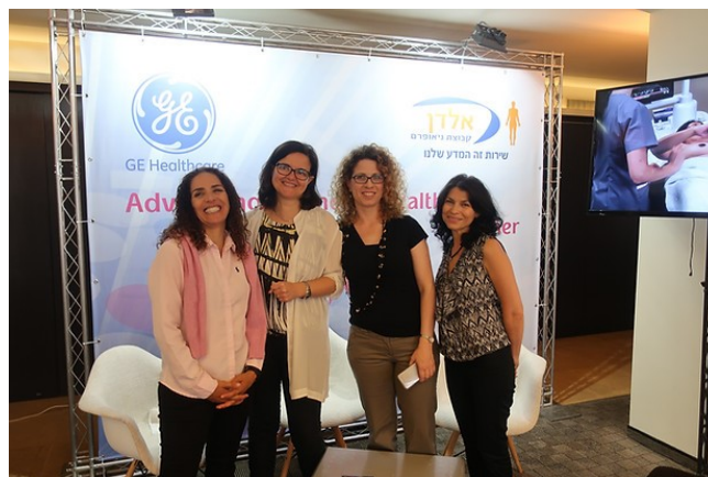
GE Exhibit at Imaging in Israel 2017